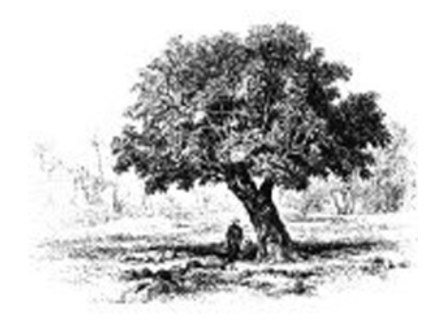
THE EQUIPPED DISCIPLE