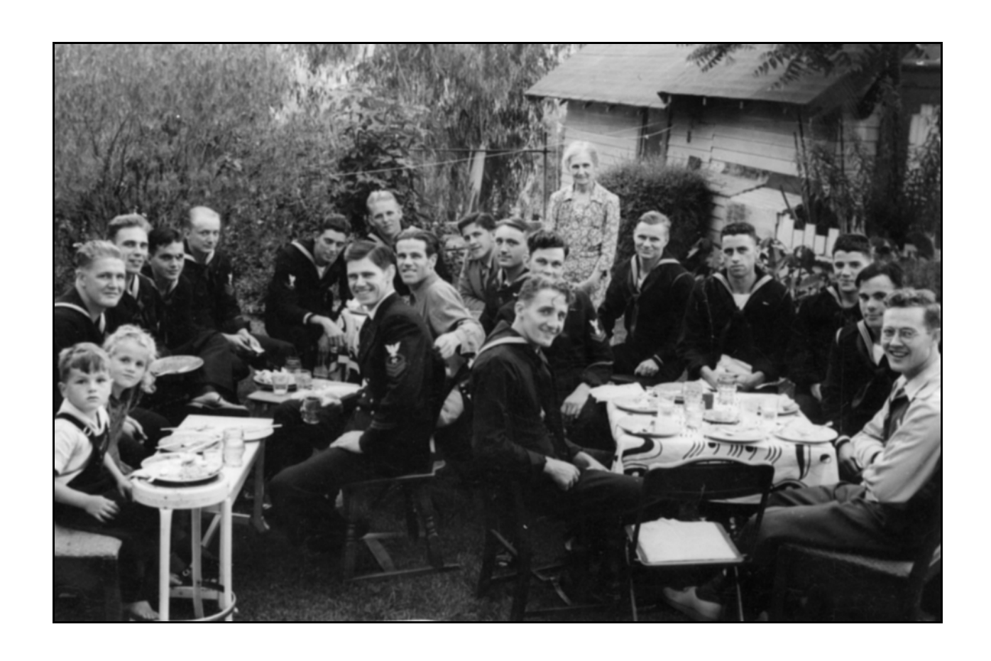
"A Passionate Call to Maturity, Spiritual Reproduction and Spiritual Parenting to Help Fulfill The Great Commission"