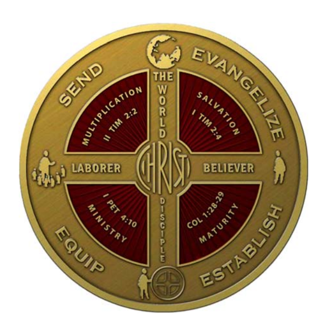
The Great Commission Illustration